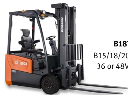
B18T-7 Series B15/18/20T-7, B18/20TL-7 36 or 48V 3 Wheel Truck