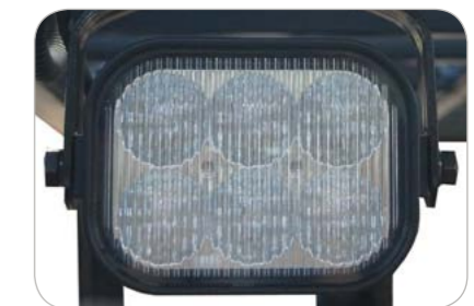
LED Lights Brighter and last longer than traditional sealed beams or halogen lights.