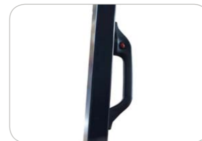
Rear Grab Bar with Horn Adds to safety, comfort and convenience when traveling in reverse.