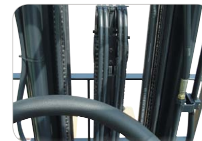
Neatly arranged Hydraulic Hoses Reduce width providing better visibility, silent staging, and added strength.