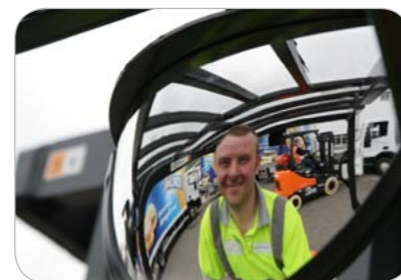
Panoramic Mirror Provides the operator a clear view of the whole back & rear working area, improving, working safety & efficiency.