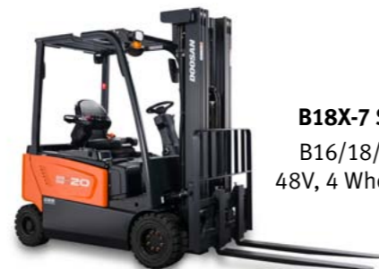
B18X-7 Series B16/18/20X-7 48V, 4 Wheel truck