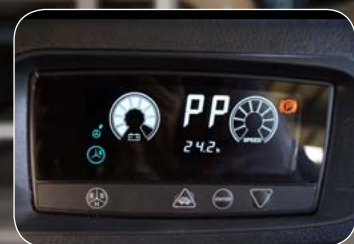
Easy to Read, Diagnosis, and Performance Setting Instrumental Panel