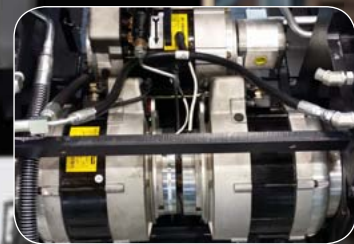
Simple, Powerful Enclosed Type Drive & Pump Motor