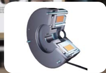
Specially Designed Electro-magnetic Auto Parking Brake