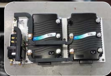
Stable, Intelligent and Ease Serviceable Curtis Controller

The specially designed Electro-magnetic Auto Parking Brake (EPB) also gives the operator leaves seat, the truck's EPB is automatically applied with unlimited ramp-hold function. Lifting & Lowering functions and offers the highest levels of efficiency and productivity.